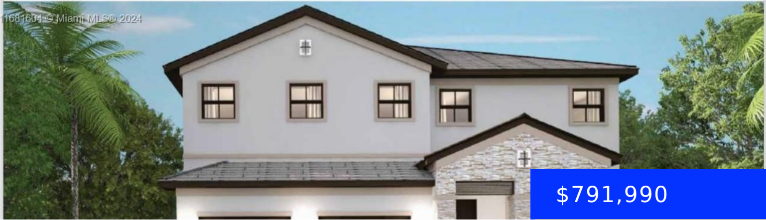
A11681804 © Miami MLS © 2024