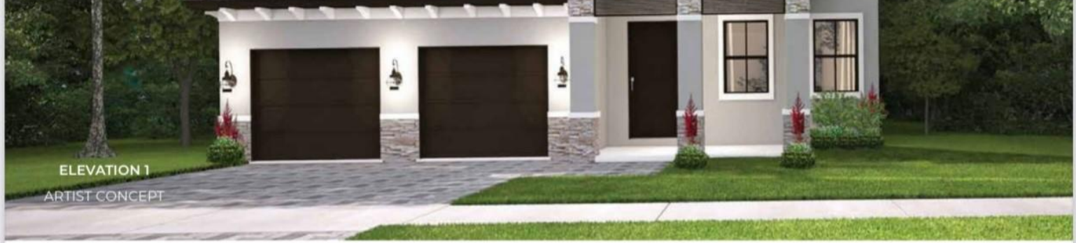
ELEVATION 1 ARTIST CONCEPT