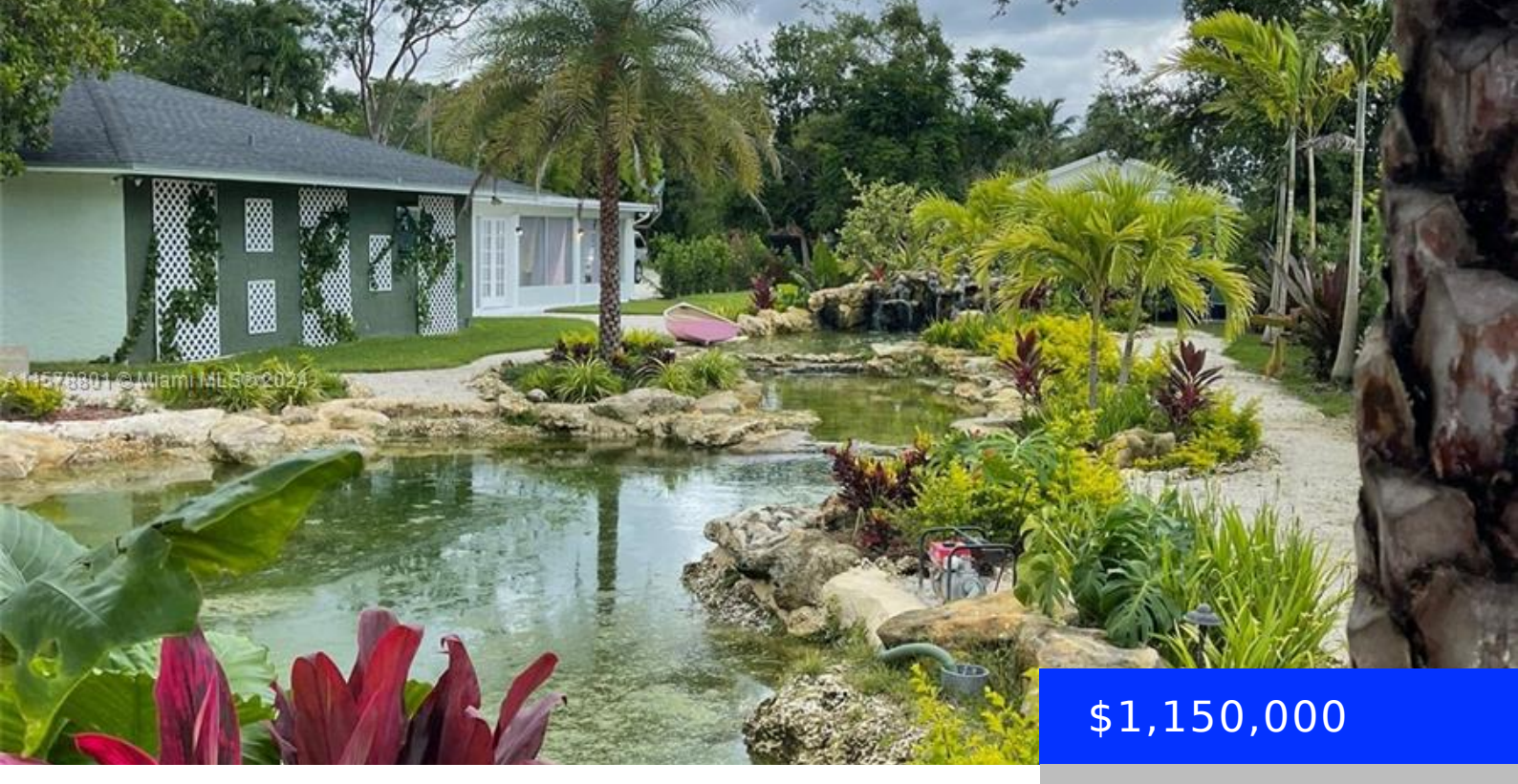
MIAMI, FL, 33187 https://ritterproperties.com

This home features a Private Oasis with a Relaxing Sanctuary! Your own Paradise minutes from near it all. This beautiful property includes updated 6 Bedrooms 4 remodeled bathrooms, large kitchen new shingle roof title flooring, impact windows and a family room sure to be the central gathering point of this home. Property also has many [...]