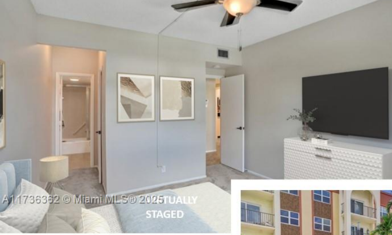
A11736362 © Miami MLS © 2025 VIRTUALLY STAGED