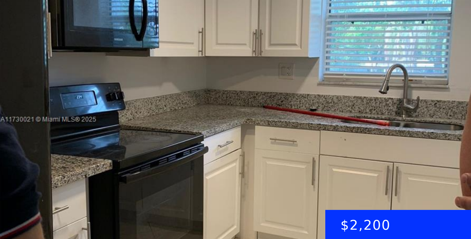
MIAMI, FL, 33172 https://ritterproperties.com

Ample 1 bedroom 1 1/2 bath centrally located, close to mayor freeways and shopping. Unit is in very good condition with new appliances/washer and dryer inside. Available on March 1rst, Please text or call listing agent for more information and showing.